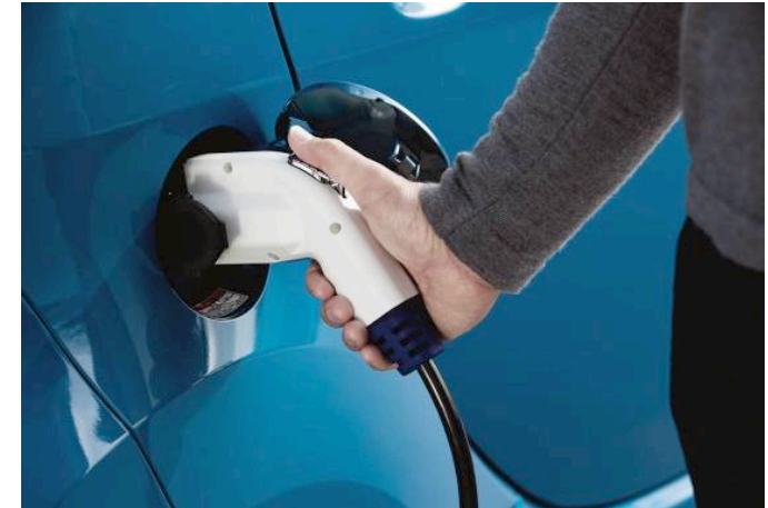
Figure 1. Option A assumes that by 2050, 100% of domestic vehicles be electric. © Peugeot

Selecting any of Option A to D does not impact on the other technologies included in the 'Shift to zero emissions transport' slider which includes buses, trains and domestic aviation.